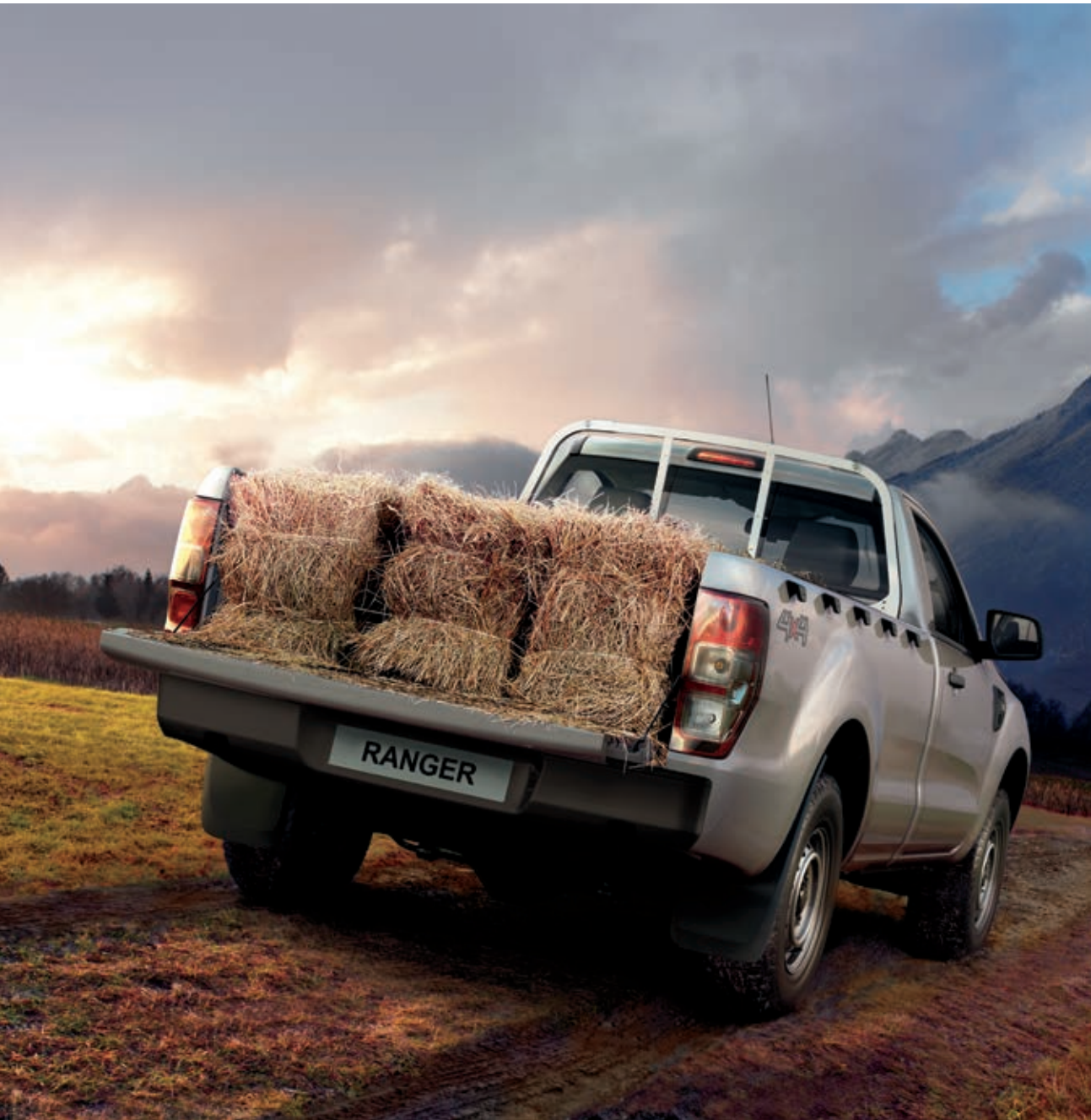
COMMERCIAL Regular Cab 4x4. Moondust Silver. Available equipment.