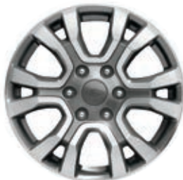
18" 6x2-Spoke Aluminum Standard

2.2L I-4 high-output diesel engine with 6-speed automatic transmission (RAP Cab) 3.2L I-5 diesel engine with 6-speed automatic transmission 3.2L I-5 diesel engine with 6-speed manual transmission 110V power inverter 240V power inverter Front park assist Rear view camera Tire Pressure Monitoring System (TPMS)