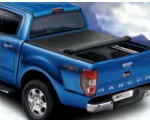
LIMITED Double Cab 4x4. Performance Blue. Hardtop with windows, ClimAir® wind deflectors, mud flaps, rear step bumper, and front and rear parking sensors Snorkel, carpeted floor mats, hard tonneau cover and tonneau cover