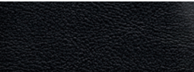
4 Soho Grain Leather in Ebony