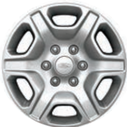
17" 6-Spoke Aluminum Standard on XLT and LIMITED