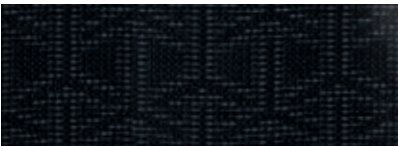
2 Circuit Cloth in Ebony