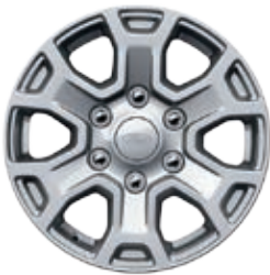
16" 6-Spoke Aluminum Available on XL