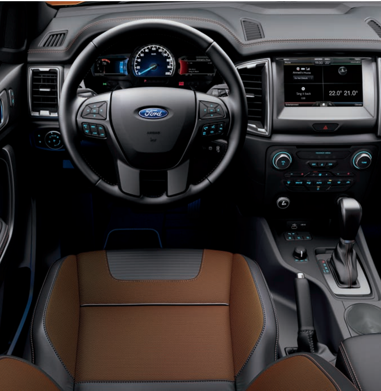
Caliber Cloth in Trak Orange and Ebony Leather in Journey Grain. Available equipment. WILDTRAK Double Cab 4x4. Pride Orange. Available equipment.