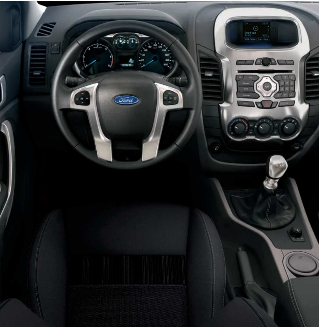
XLT. Ebony Cloth in Penta pattern. Available equipment.