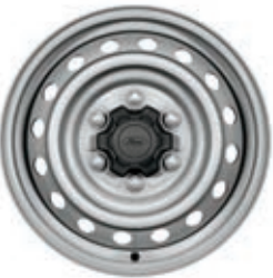
16" x 6.5" Steel (4x2) 16" x 7" Steel (4x4) Standard on COMMERCIAL and XL