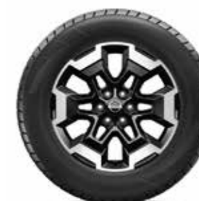
N-CONNECTA and TEKNA 18" ALLOY WHEELS