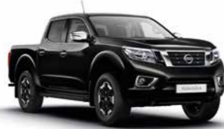
METALLIC BLACK (M)