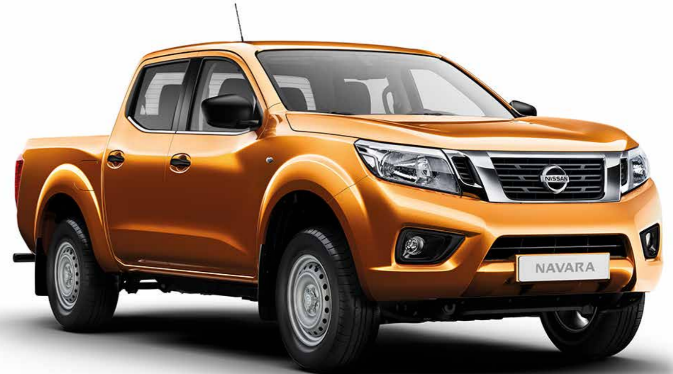
Image shown in Navara Visia Double Cab.