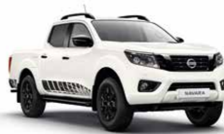
STORM WHITE (P)