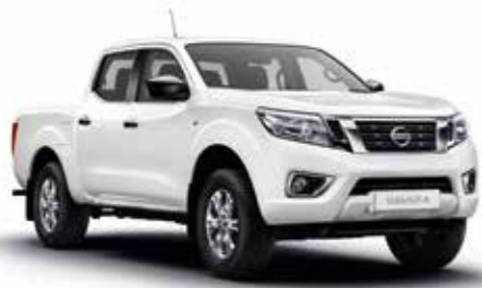
ALABASTER WHITE (S)

(S) = Solid (M) = Metallic (cost option) (P) = Pearlescent (cost option)