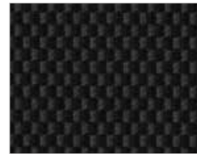
VISIA and ACENTA GRAPHITE CLOTH