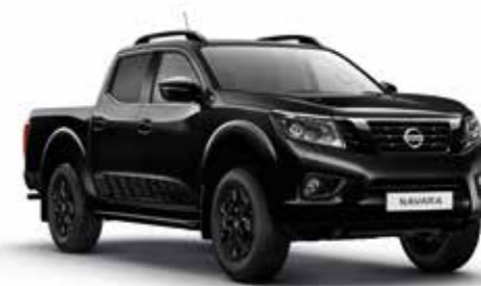
METALLIC BLACK (M)