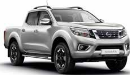
STARBURST SILVER (M)