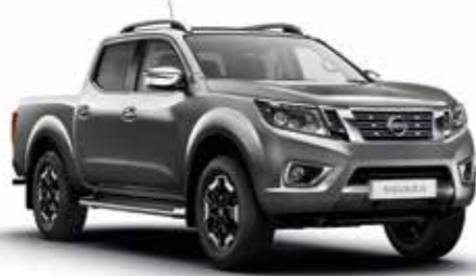
TWILIGHT GREY (M)