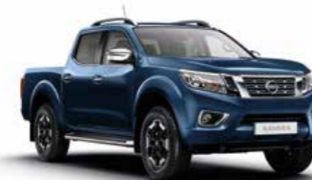
CAYMAN BLUE (M)