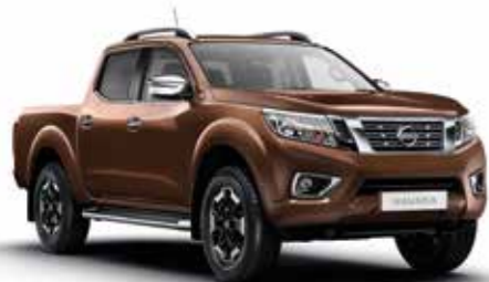
EARTH BRONZE (M)