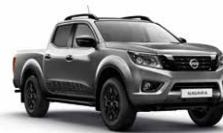
TWILIGHT GREY (M)