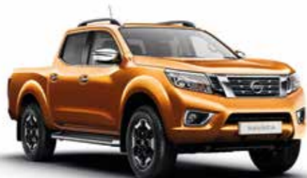
SAVANNAH YELLOW (M)