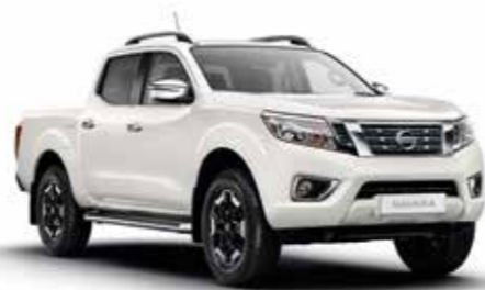
STORM WHITE (P)*