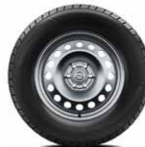
VISIA 17" STEEL WHEELS