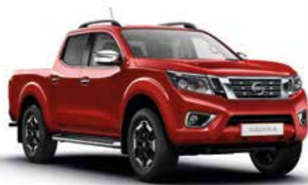
FLAME RED (S)