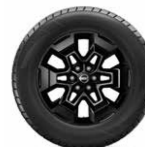
N-GUARD 18" BLACK ALLOY WHEELS