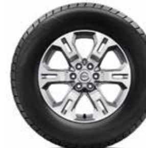
ACENTA 17" ALLOY WHEELS