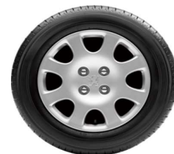
15" Auckland Wheel Trims