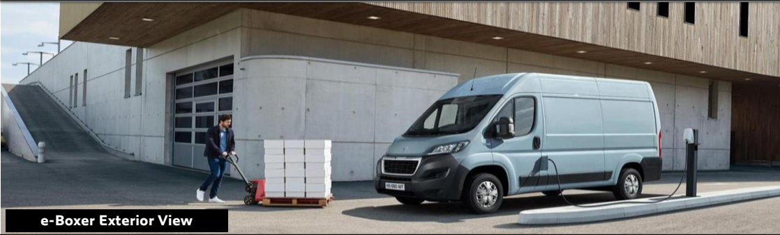
e-Boxer Exterior View