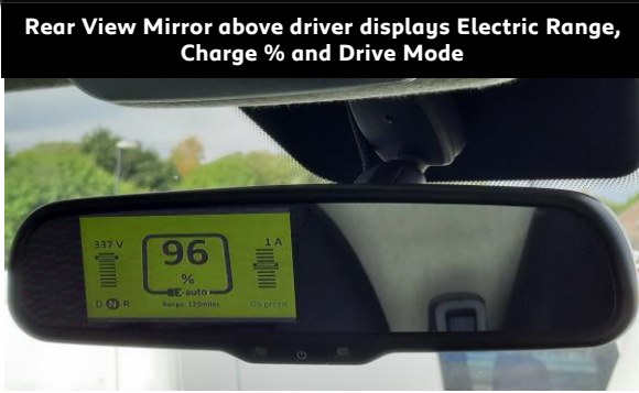
Rear View Mirror above driver displays Electric Range, Charge % and Drive Mode