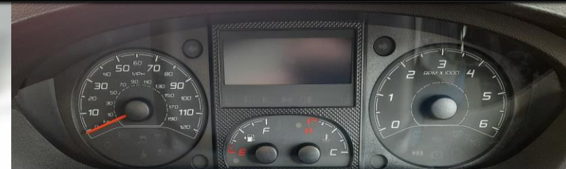
Dials for RPM, Fuel & Engine Temperature are still positioned behind steering wheel but the needles have been removed as this information is not required for e-Boxer