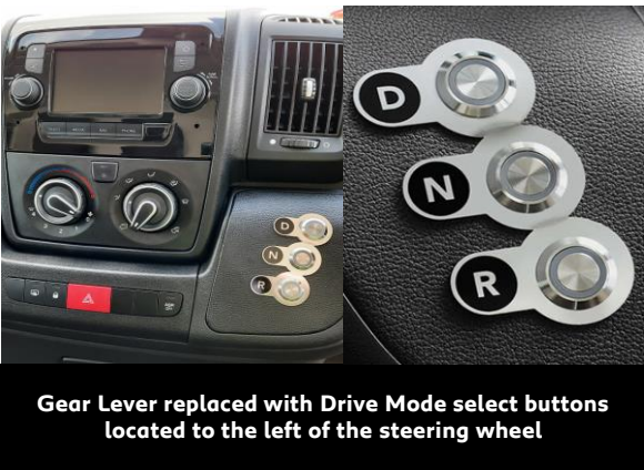
Gear Lever replaced with Drive Mode select buttons located to the left of the steering wheel