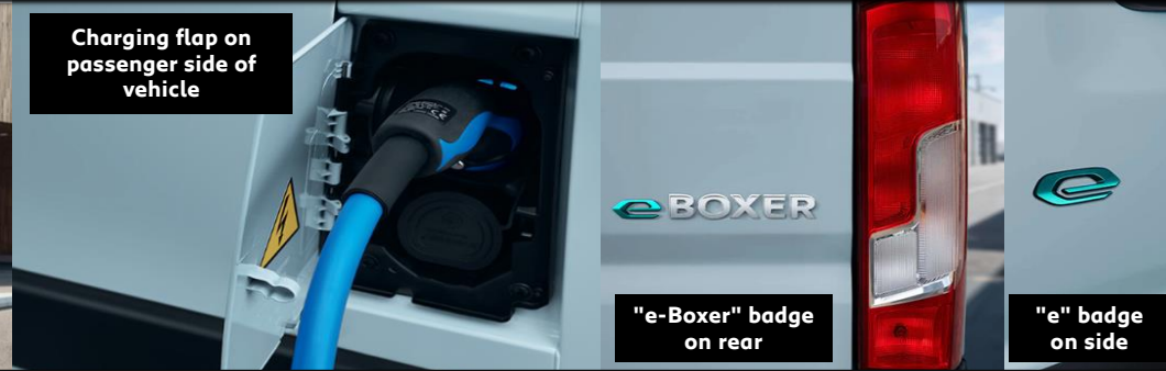
Charging flap on passenger side of vehicle